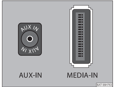
Fig. 2 AUX-IN and MEDIA-IN socket

Depending on the vehicle, the AUX-IN socket is located in the glove box or in the centre console or armrest between the front seats.