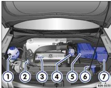
Fig. 2 Engine compartment overview.