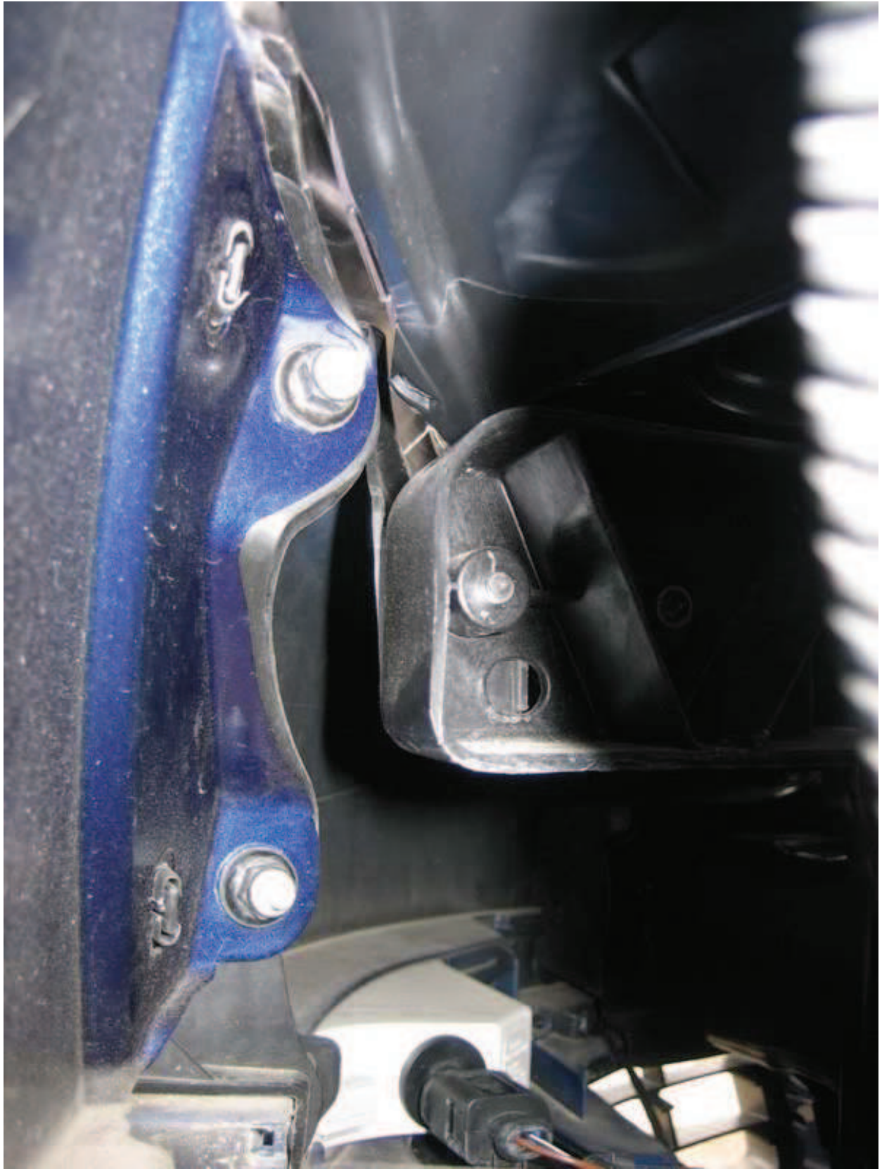
[Inside left wheel well looking toward front of car]